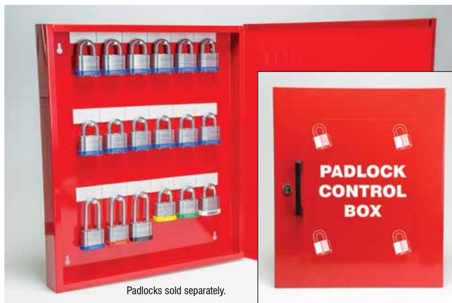
Padlocks sold separately.