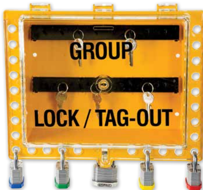
Hinge Cover KCC630